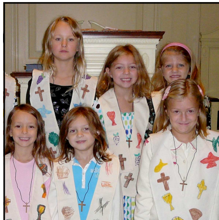
Previous participants in the Preparation for Communion workshop model their worship stoles.

Welcoming Children to the Lord's Table is a goal of the Children and Family Committee. Children in Kindergarten and first grade and their parents are invited to attend a hands-on workshop Sunday, January 8, at 2:00 p.m. We will begin in Room A-201. Register by contacting the Christian Education Office at 304-343-8961 x 122.