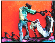
2011-2012 PW Horizons Bible Study

This special annual program is a combined Bible Study with all circles meeting together following the January luncheon.