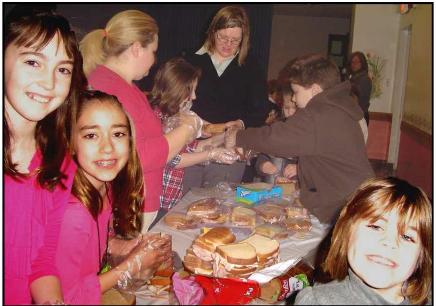
Covenant Kids prepared and delivered 200 sandwiches, fruit and snacks to Manna Meal on March 6.